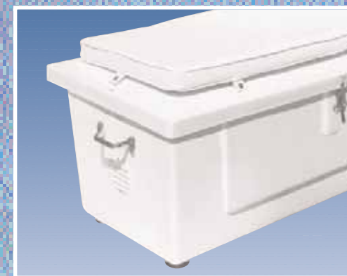
Model 418 shown with optional seat cushion, handles, vents and rubber legs.

Better Way Products offers several options to expand the use and convenience of their full-line of storage units.