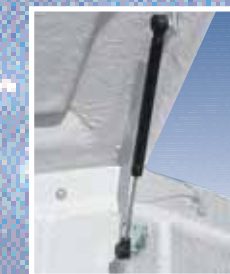
Optional removable storage tray and gas lifts are shown on Model 323. The optional gas lifts (inset photo) are easy to install. They snap on pre-mounted brackets instantly.